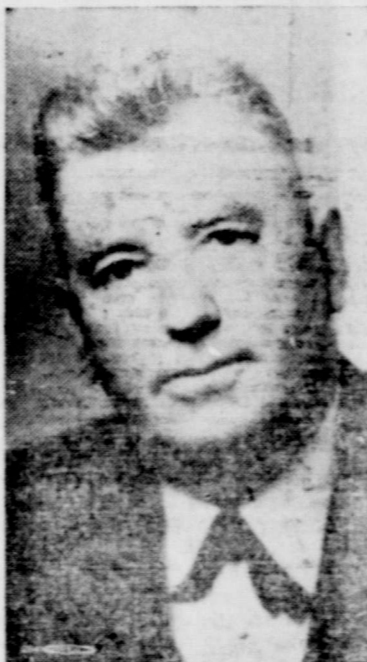
Candidate For Lieut. Governor of Texas

A native Texan, 12 years in State Legislature where he has fought vigorously for a liberal old-age assistance, better rural schools, farm-to-market roads and the right of soldiers to vote without payment of poll taxes.