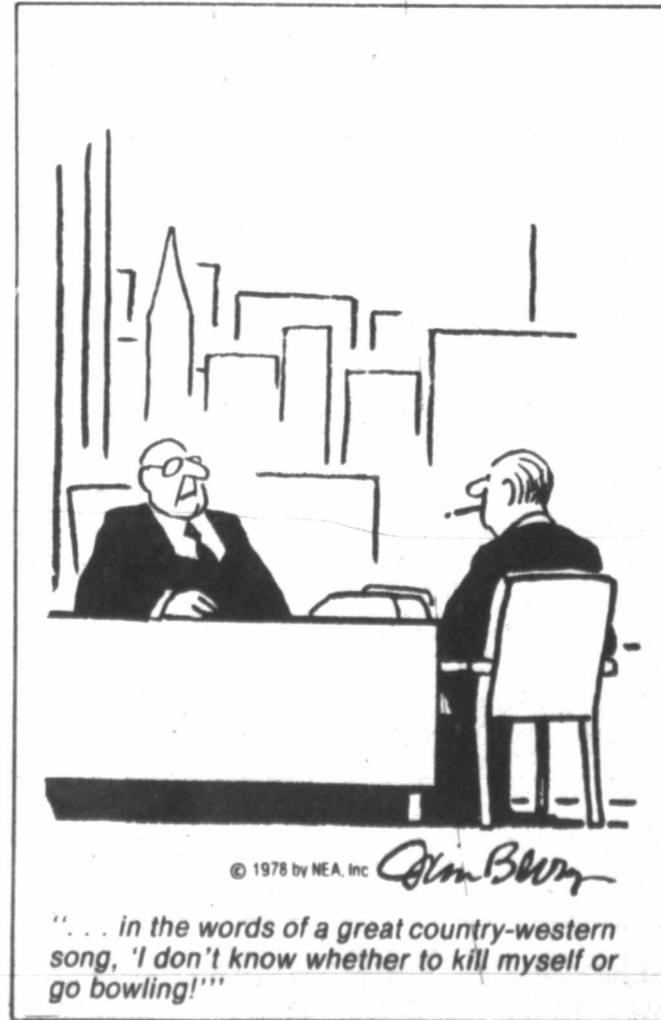
"... in the words of a great country-western song, I don't know whether to kill myself or go bowling!"

Serving the Top 'O Texas 73 Years Pampa, Texas 79065 403 W. Atchison PO Box 2198