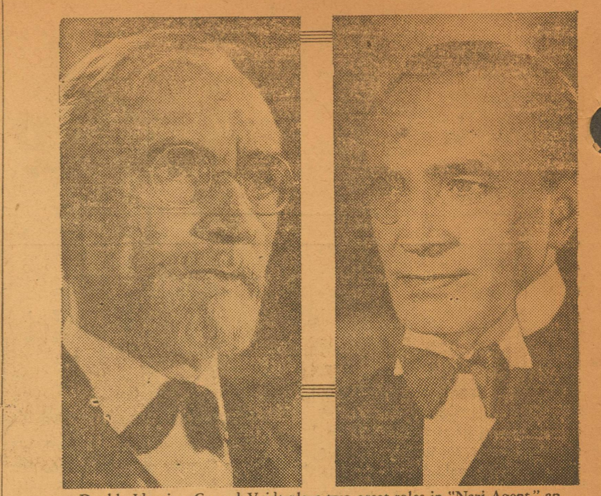
Double Identity...Conrad Veidt plays two great roles in "Nazi Agent," an espionage story dealing with the inner-workings of America's 6th Column!