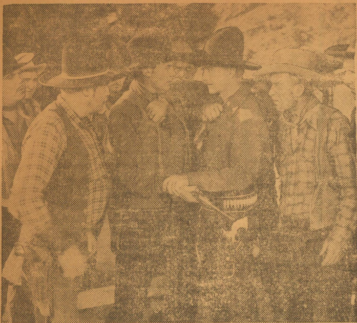
Just one of the spine-tingling scenes from "Stick to Your Guns," the new screen adventure of Hopalong Cassidy, beloved Western hero.