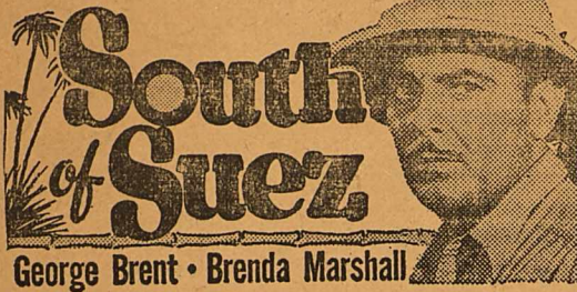
George Brent • Brenda Marshall

Preview Saturday Night SUNDAY and MONDAY January 12 and 13