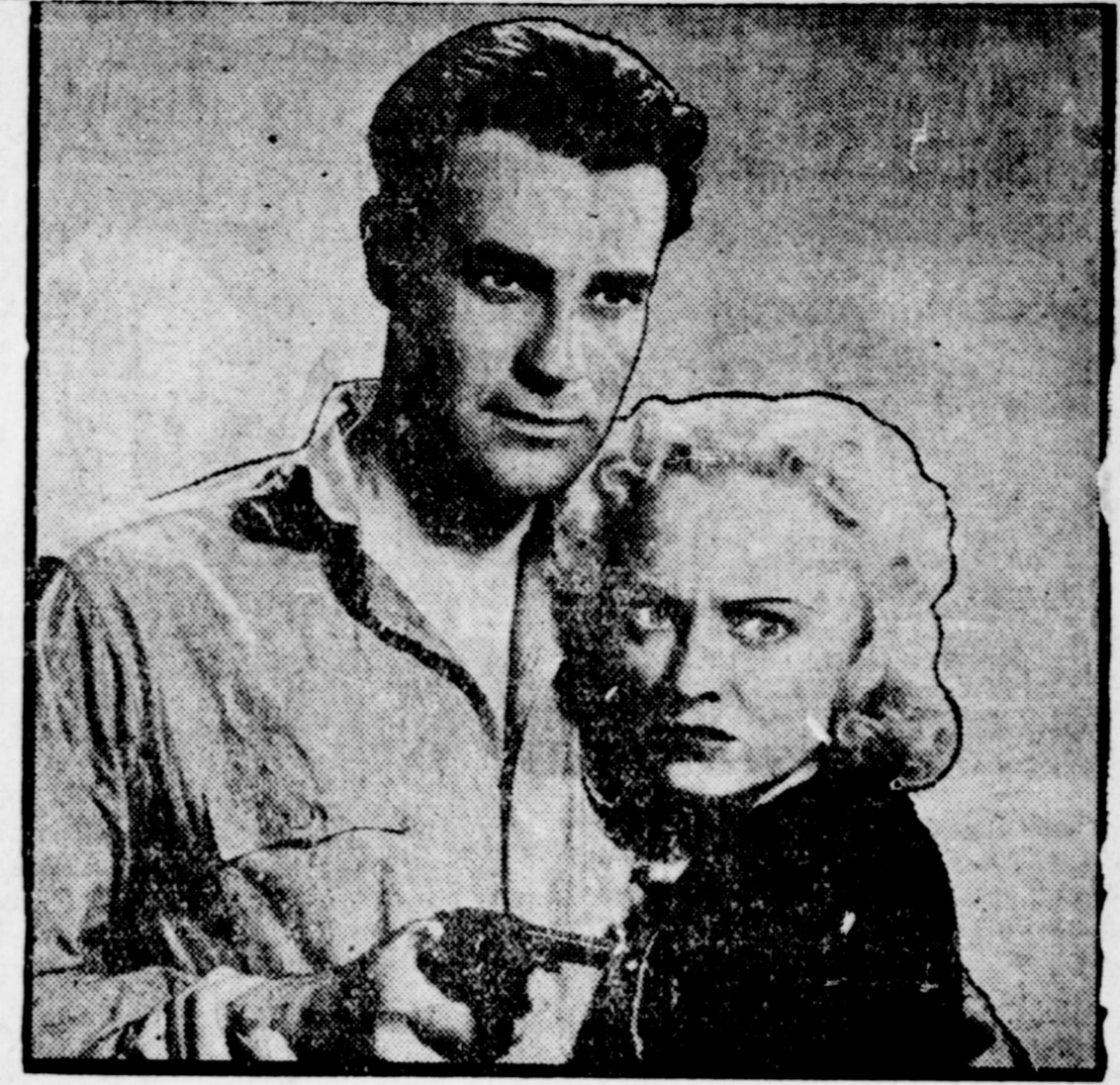
Here's drama that strikes close to every home . . . the drama of dangerous daughters, reckless, wilful, wild but not really vicious—yet! What does probation mean for these girls . . . a chance to go straight or another chance to get into trouble? For the startling answer to these questions you dare not ask . . . see "Girls on Probation" showing at the Palace Theatre Friday, both matinee and night.