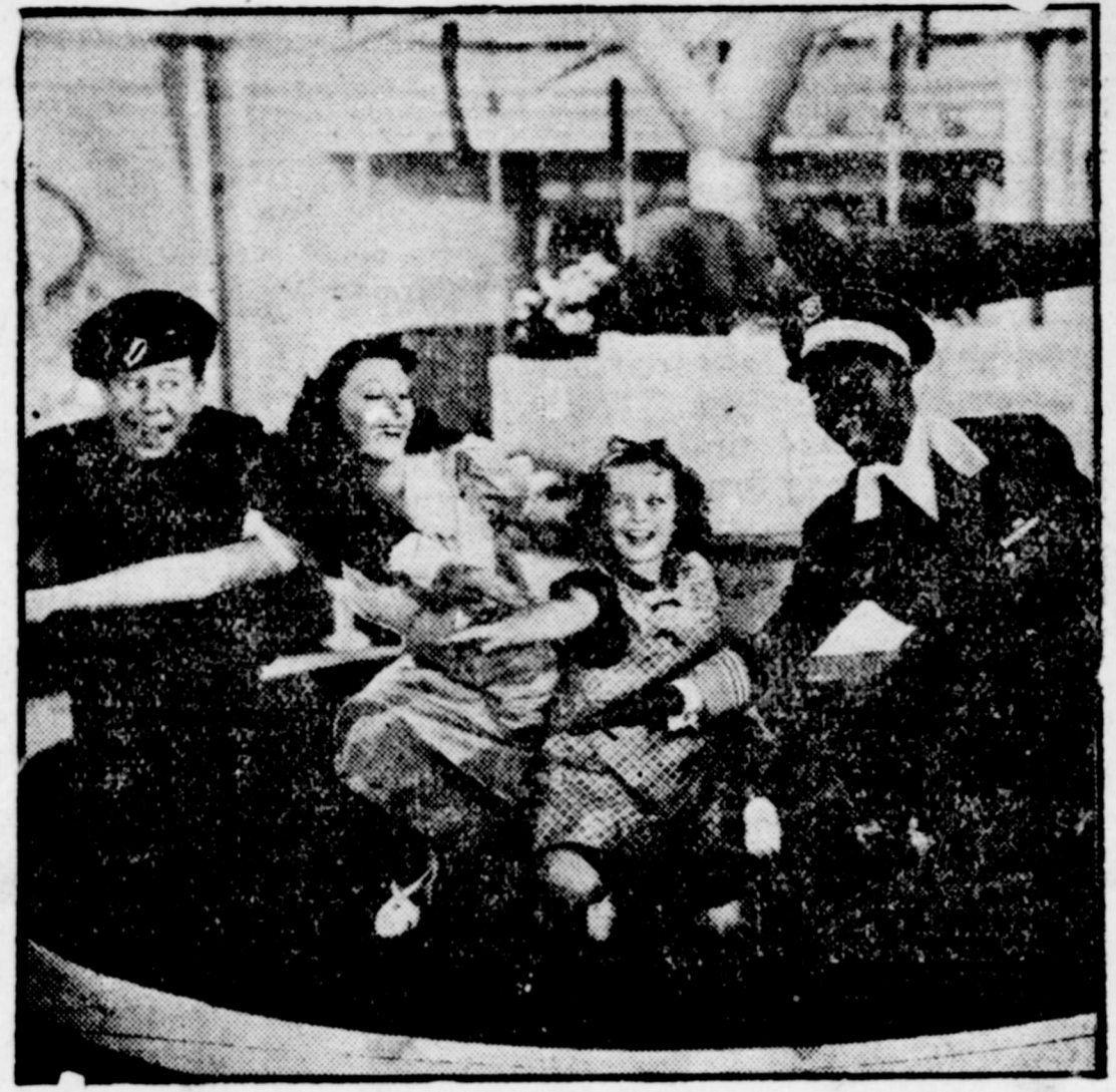
A great big beaming picture of the joy in life today . . . A real love story . . . A marvelous cast . . . Laughs every time you wink . . . and sweet and rapid rhythms! Shirley Temple, Joan Davis, Bill Robinson and Bert Lahr in "Just Around the Corner," the New Year's attractions at the Palace Theatre Sunday and Monday. Walt Disney's new all Technicolor cartoon, "Ferdinand the Bull" is also on the program.