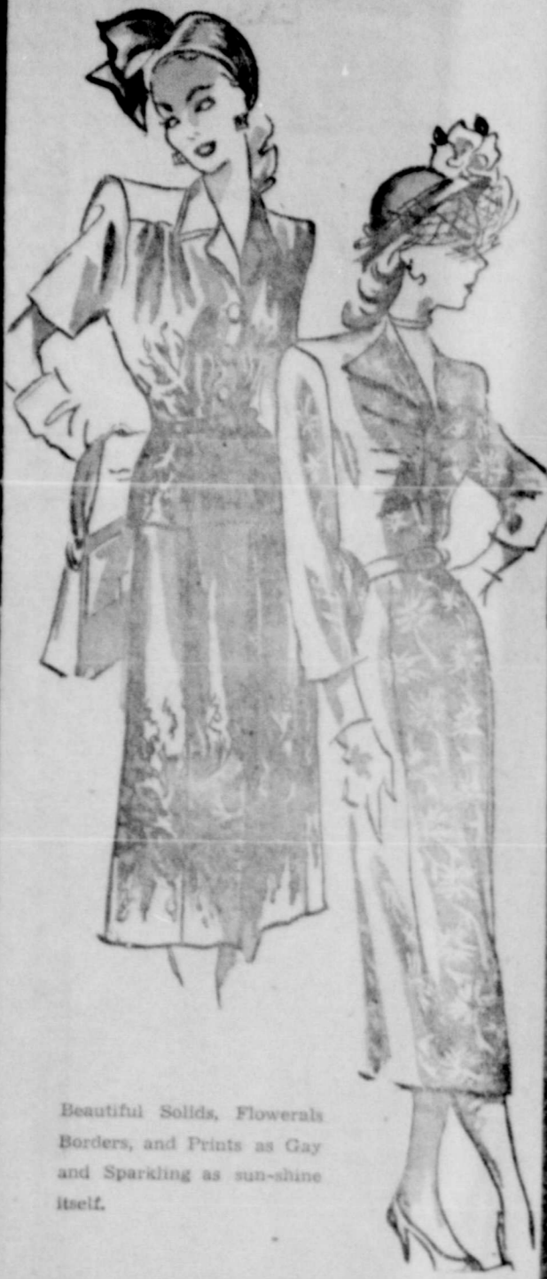
Beautiful Solids, Flowered Borders, and Prints as Gay and Sparkling as sun-shine itself.

Famous Brands Nationally Advertised Entire Stock to Choose From Rayons — Cottons $11.75 values ----- 7.99 $15.75 values ----- 8.99 $19.75 values ----- 10.99 $33.75 values ----- 16.99