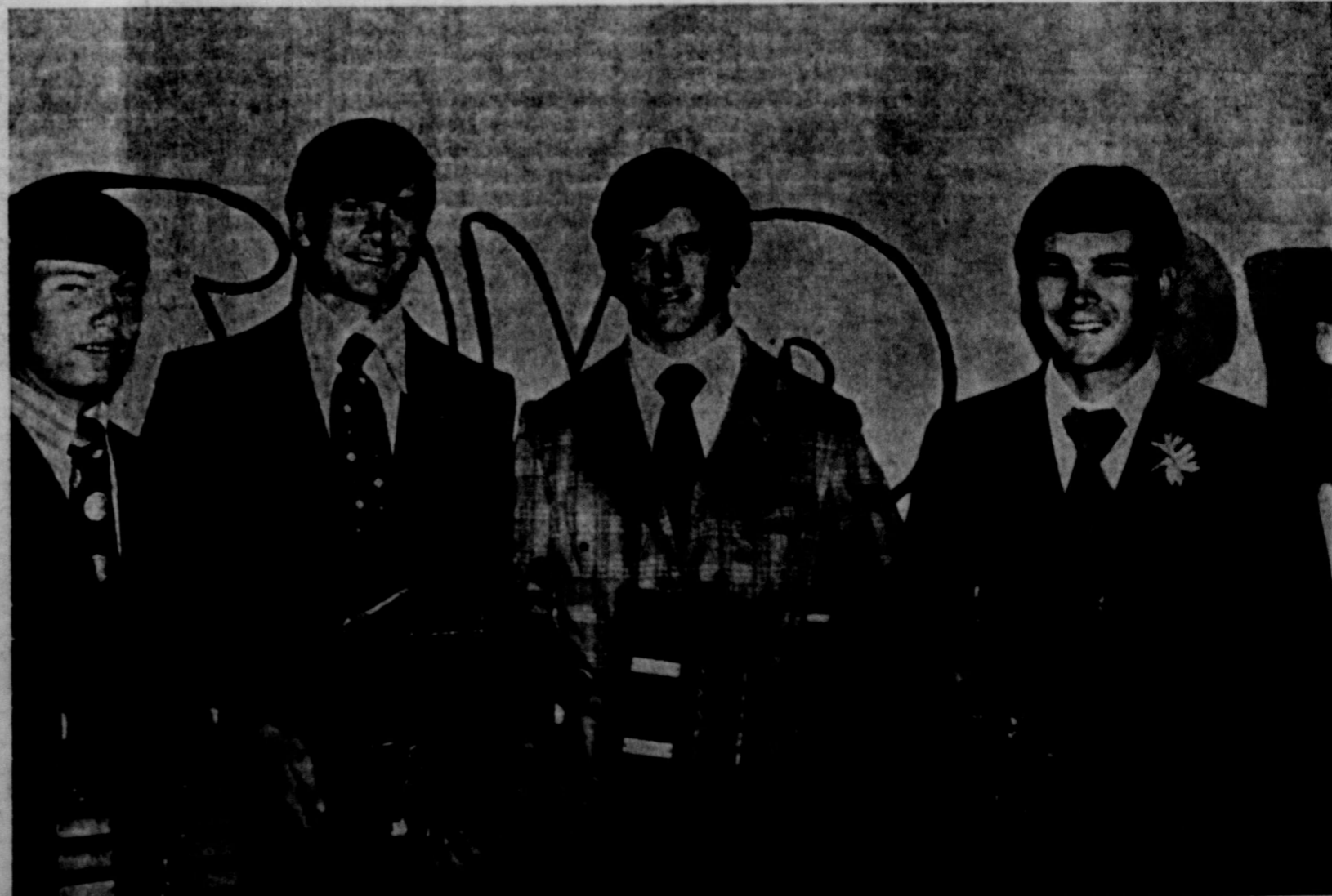
ATHLETES HONORED—These four members of the 1973 Tiger football team received special

School lunchroom personnel served the chicken dinner to approximately 150 students and guests.