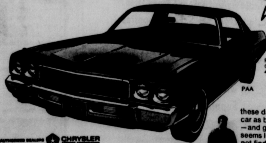
Plymouth Fury Gran Sedan 4-Door Hardtop

PAA Ignition System, standard. And it runs on regular gas—which is pretty important these days. Now, when you can get a car as beautiful and well-built as a Fury—and get it at a year-end price—that seems like solid value to me. But why not find out for yourself about Fury value. Spend a few minutes with your Chrysler-Plymouth dealer.