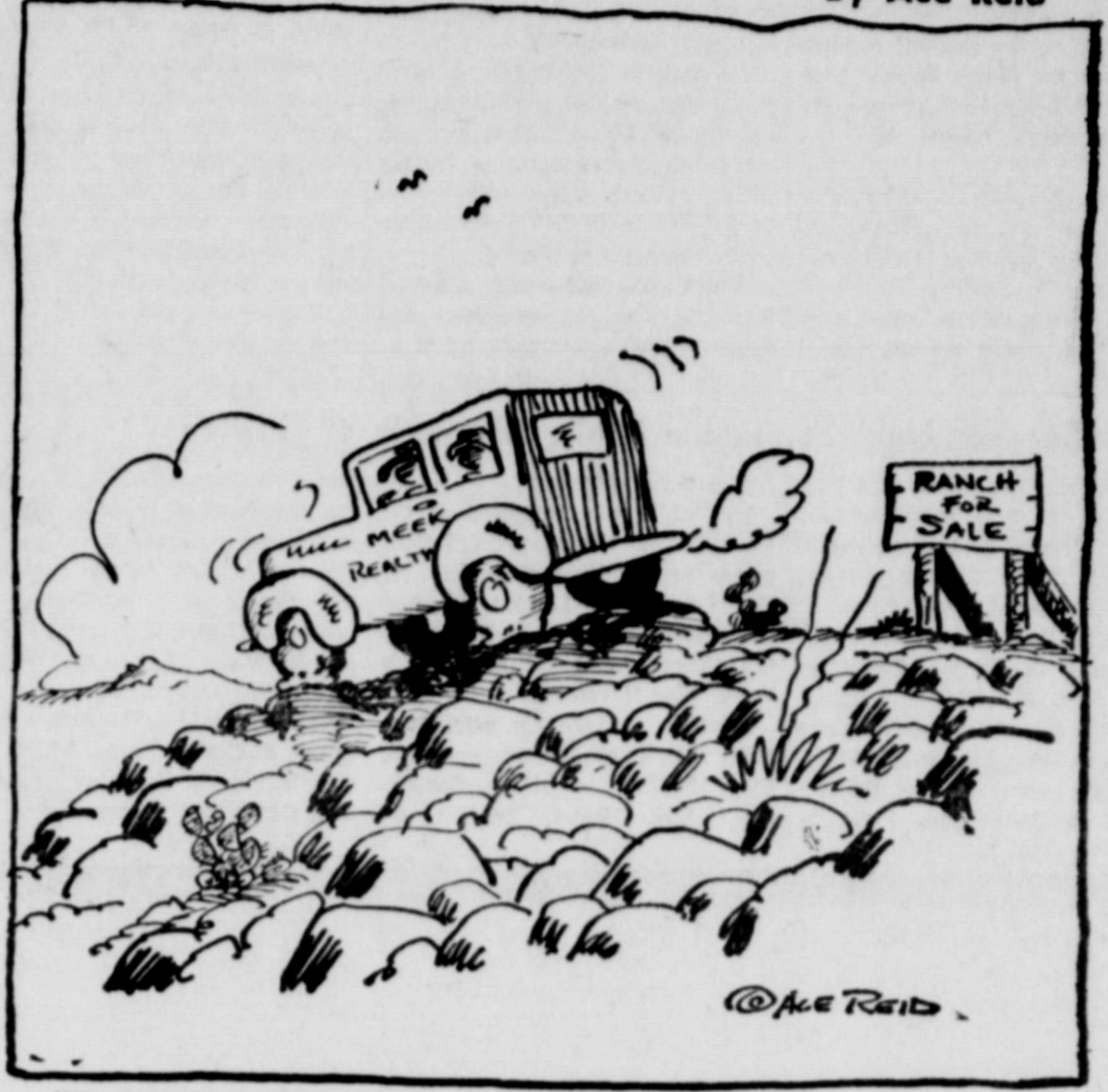
"God said he wasn't makin' anymore land! Wul, if he messed up on the rest of it like he did this. I don't blame him!"

will not be published in that particular issue.