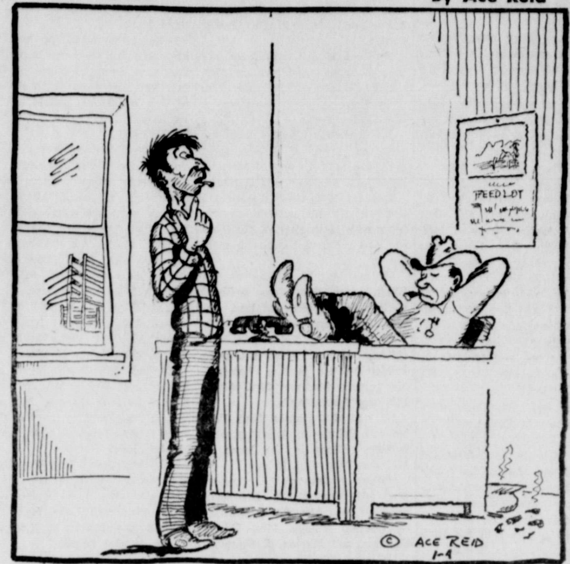
"Now, if I work for you for $200 a month for 5000 months, that's a million dollars. Are you sure you have that much money?"