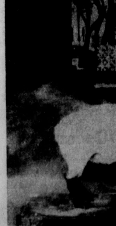
WHAT'S THIS?—Nothing too unusual about this picture—except the sheep are being washed and groomed in a CAR WASH! Gene Hicks put gates

to San Saba. Ruth Salmon (Miss Kitty) and Buddy Randals (Slick the Gambler) were winners of the