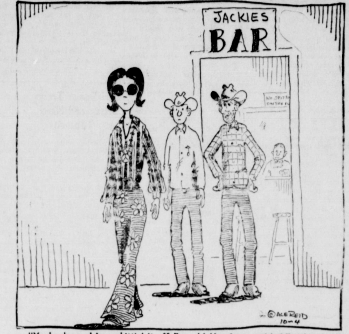
"Yeah, she and I was hittin' it off fine, drinking beer and holding hands, then I find out he's a car salesman from California!"