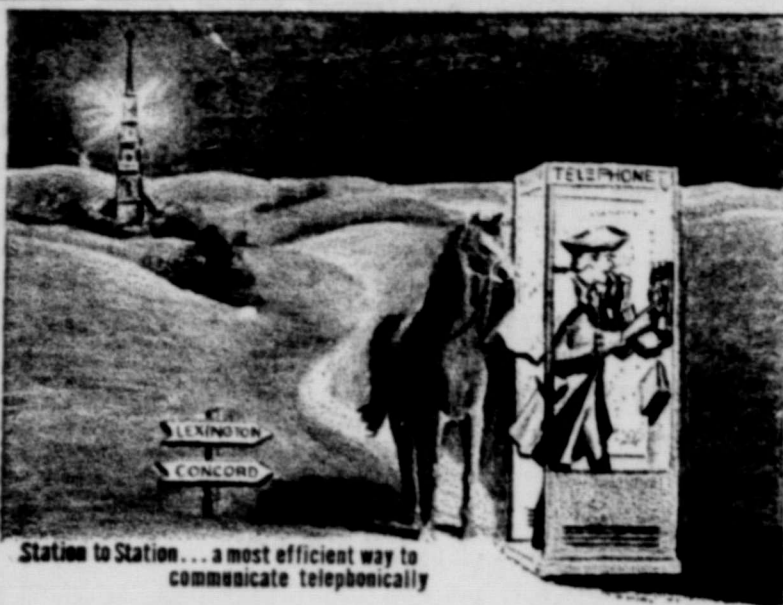
Station to Station... a most efficient way to communicate telephonically