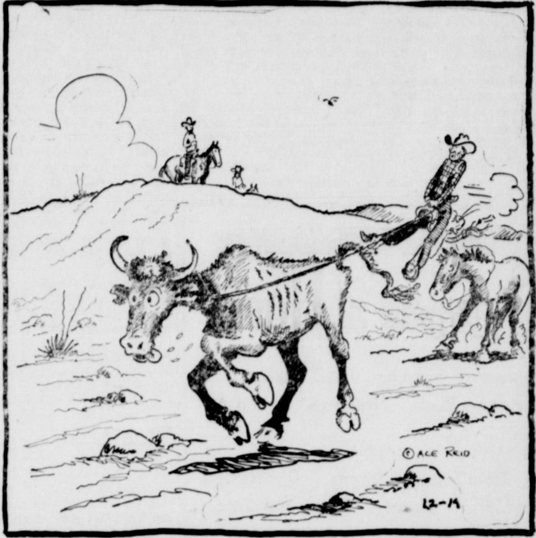
"I shore wish one of you fellers would loan me a pocket knife to cut loose from this ole steer. before one of us aits hurt!"

... intervals to keep the re-invasion of mesquite plants from producing beans. Hunting is a safe sport in comparison to many other activities, but tragedy can mar the pleasure of the hunt. Already reports are coming in telling of accidents caused by carelessness and unthinking hunters, and the hunting season is still young. The kind of clothing worn can save lives. A vest and cap of fluorescent blaze orange color is suggested. A hunter wearing such apparel is clearly visible to hunting companions and it helps reduce the possibility of mistaken identity on the part of other hunters. Research has shown fluorescent blaze orange to be the most visible color for hunters to wear. It is especially desirable since its reflection qualities permit color blind persons to detect another hunter.