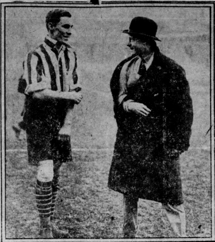
PRINCE OF WALES UP AND AROUND AFTER FALL FROM HORSE.