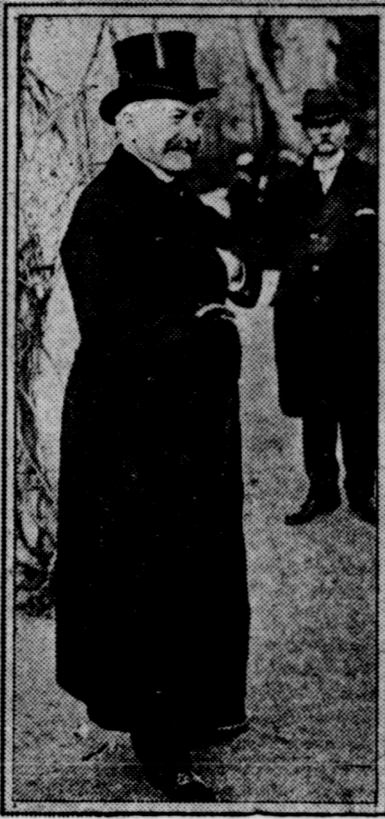
Tallyrand Offers Vast Estates For Sale At Auction.

There was much jest as to the dough in Doheny, but so far the public has been spared of the joke of the ouch in Daugherty.—St. Louis Times.