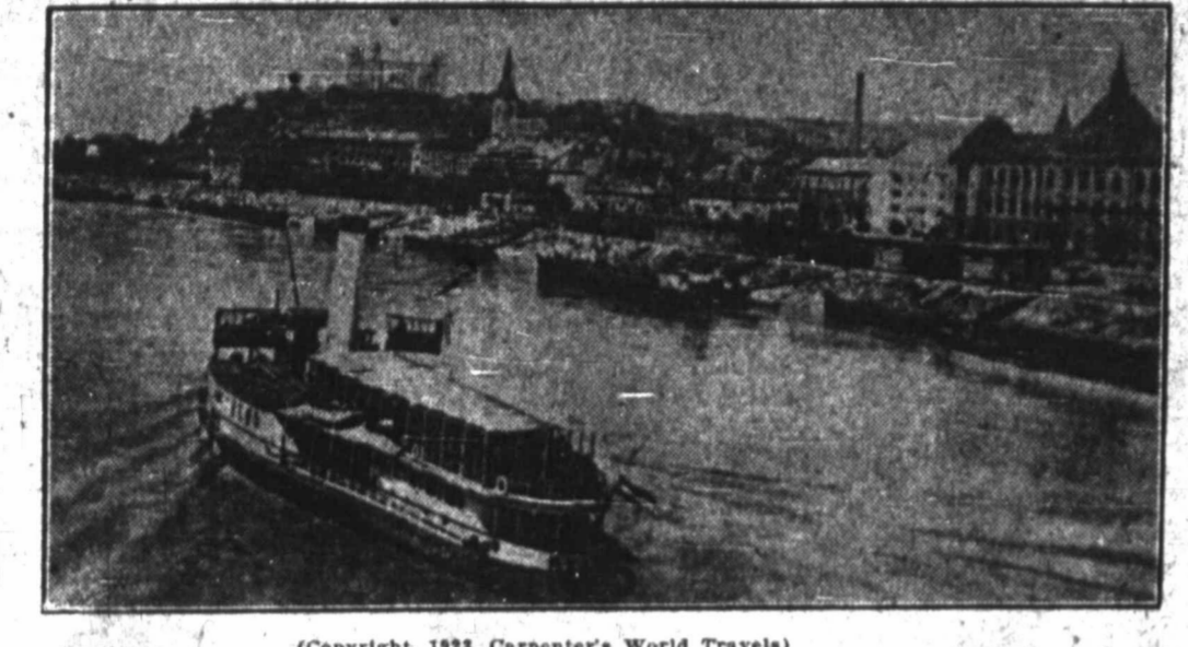
Bratislava, the capital of Slovakia, lies on the banks of the Danube River. The city once belonged to Hungary, and it was here that the Hapsburgs were first crowned kings.