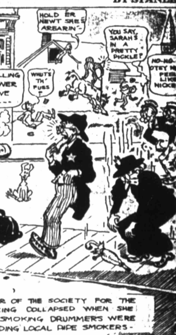
THE "PSYCHOLOGICAL MOMENT" THE MAJOR PICKED TO SELL THE PARROT