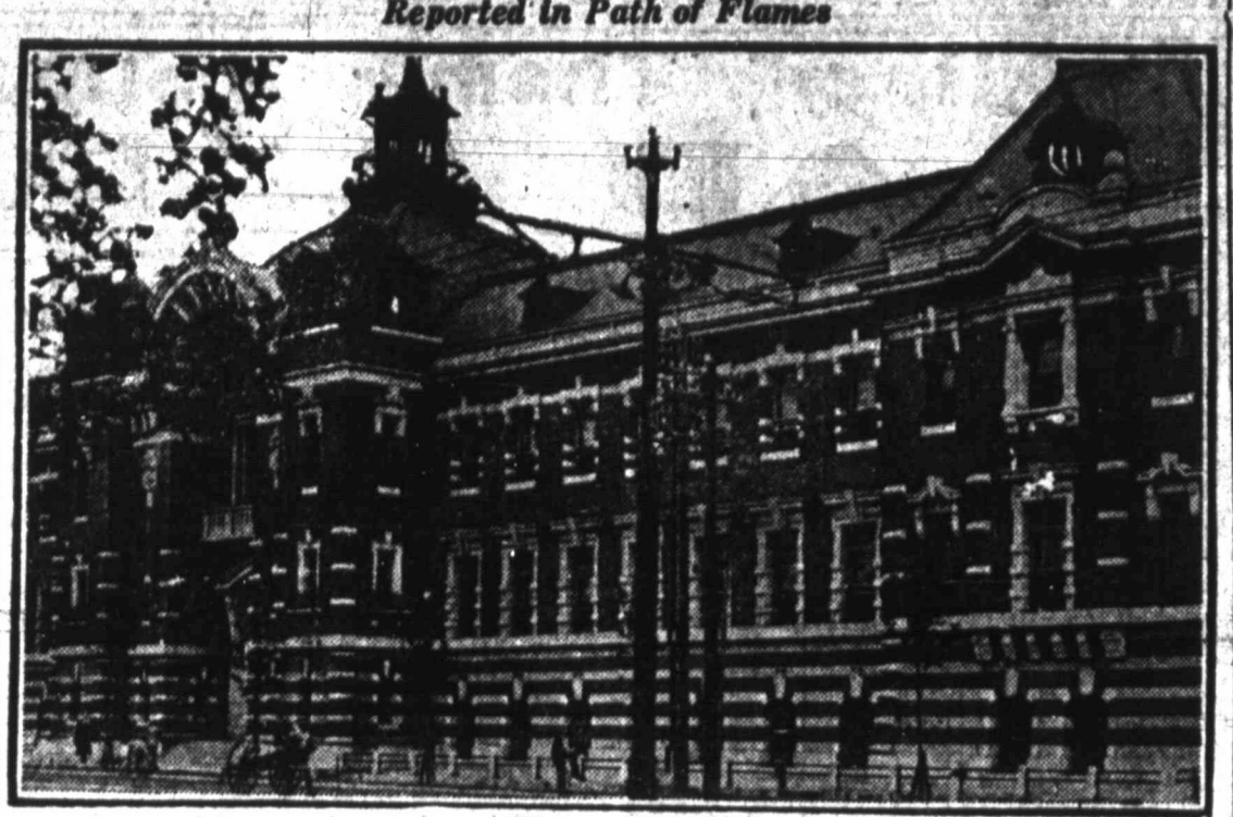
News dispatches from Japan indicate the Metropolitan Police Office of Tokyo was utterly destroyed by the quake and flames that laid waste the Japanese capital. It was the most complete police structure in the orient.