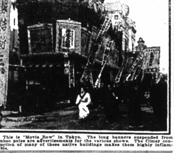
This is "Movie Row" in Tokyo. The long banners suspended from the bamboo poles are advertisements for the destruction of many of these native buildings makes them highly inflammable.