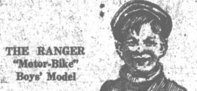
THE RANGER "Motor-Bike" Boys' Model

Workers are not limited as to age or sex. Men and women will have their choice of full-sized bicycles for themselves or the boys' or girls' models.