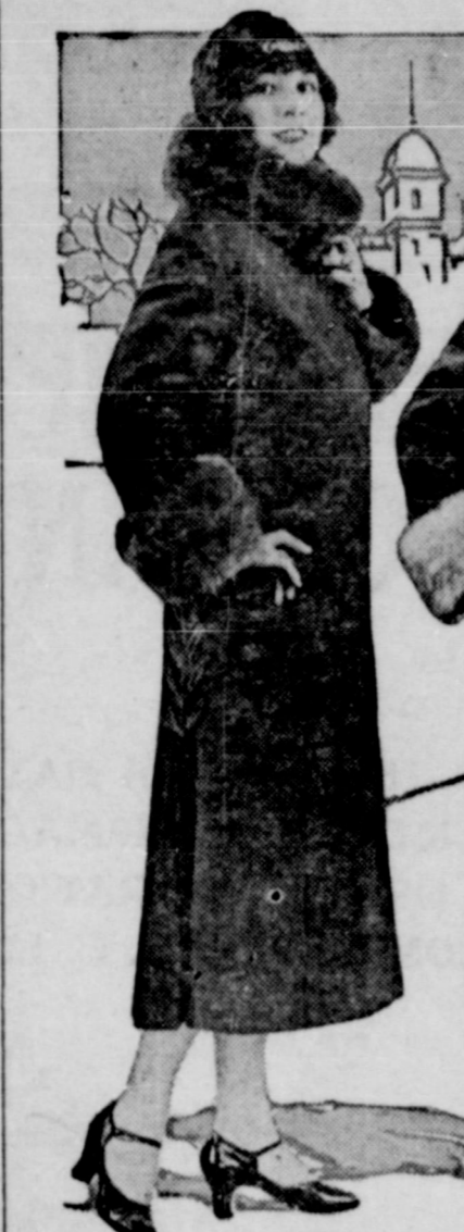
Two of the Latest Winter Coats.

DRAWING conclusions from the early coat arrivals women of fashion are destined to be wrapped in the folds of luxury during the forthcoming months. There is a sumptuousness about present-day cloth-with-fur coats which lies beyond the power of pen or tongue to tell. Only "seeing is believing," for even a most vivid gift of imagination might fall short of visualizing the elegancies of fur and fabric and color glory which combine to produce the modern topcoat.