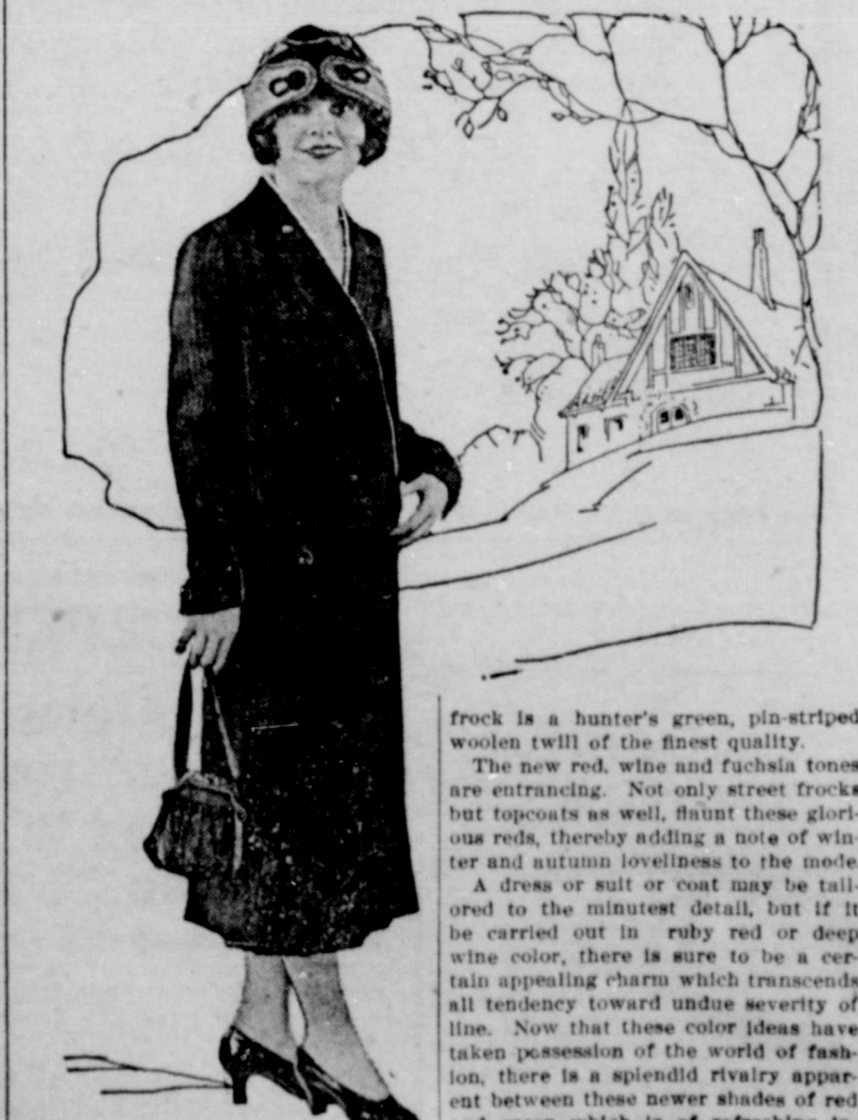
Tailored Frock for Autumn.

The handsome street gown here pictured interprets hemline fullness through expert manipulation of invert-