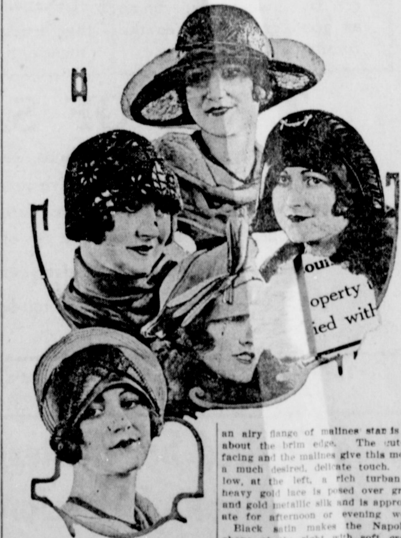
Some Midwinter Hats.

classic furs or in the popular varieties whose origin is more or less a mystery to the average citizen. Among the handsomest and most expensive of fine furs is black broadtail, and a coat made of it, as illustrated here, shows how reserved and plain the styles are. It is straight in line, with flaring sleeves, and has a collar, cuffs and bottom finish of very choice marten. Coats made of small skins, such as mink or squirrel, or even the superb and costly Russian sable, reveal the same restraint in styling. In nearly all of them the small pelts are sewed in vertical lines, with no effort at any fanciful effects. When these top-liners lead the way toward simplicity all the humble performers in the fur drama are likely to follow. The straightline coat has a rival in flared styles, but these also are simply constructed. The list of popular furs is long, including caracul in black, brown, gray