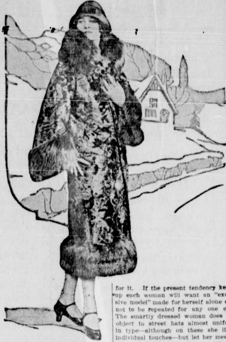
Of Black Broadtail.

AS THE winter comes on and fur coats grow more and more numerous on the streets, the early prophecy of stylists is fulfilled. Forerunners of fur modes, presented in the early fall and late summer, showed a return to simple treatments in making up the pelts into garments, and now it is evident that the public approves this conservative styling. There is little fussiness about fur coats, either in the fine