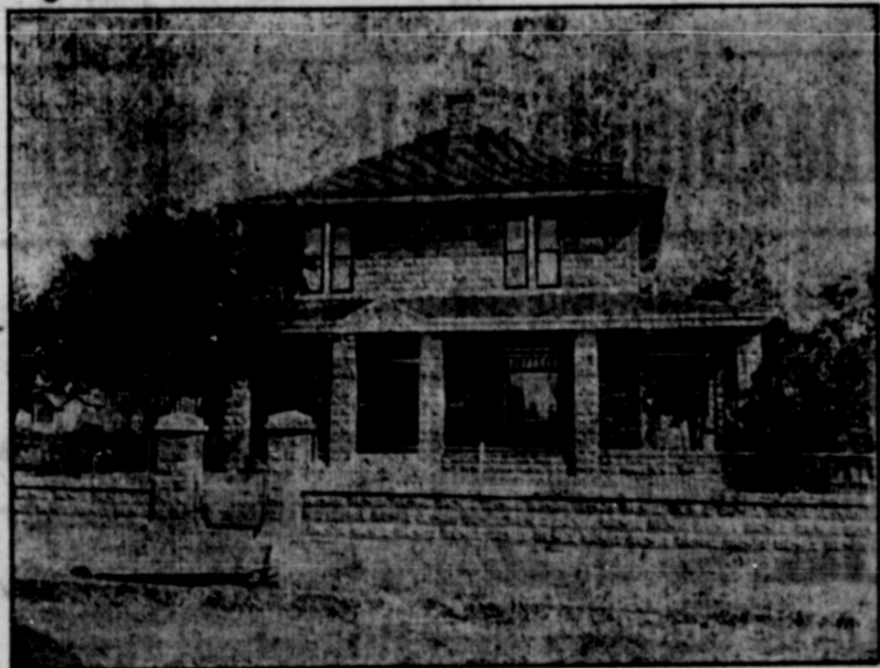
(Residence built of Sweetwater concrete blocks)

Concrete Blocks make beautiful houses. Let us figure with you when you want Foundations, retaining walls,