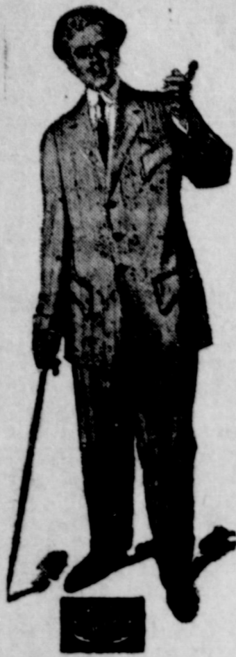
DESIGNED BY H. A. SEINSHMEIER & CO. CINCINNATI

T HERE'S all the snap of the season—the breeze and briskness of fall in our new models, just out of their wrappings.