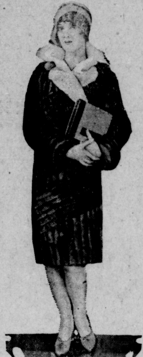
Myrna Loy, Warner star, in a most attractive coat of dyed ermine trimmed with a white ermine collar. While the coat is simply made, the skins are laid in such a way as to be in themselves a decoration to the coat.