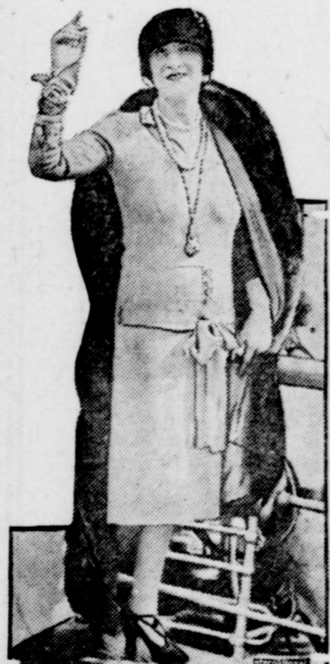
Mary Garden, famed operatic star, as she landed in New York from France announcing that she had reduced to 118 pounds and had bobbed her hair.