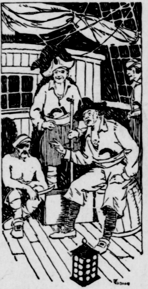
"How'd I Do That, Allardyce?" Inquired Flint Softly.

and the rustle of men crowded close together. "Well, speak up, fo'castle," he went on with a note of satire... "There's sense in that," agreed Flint... "There'll be one of us come back—and 'twouldn't be me..."