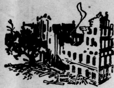
This Sketch Was Made From An Actual Photograph

FOR RENT —4 room cottage with bath. Phone 214.