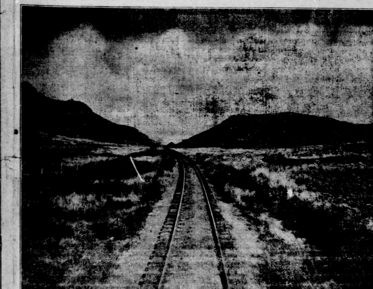
Piasso Pass Highest Point On Southern Pacific Lines 5080.