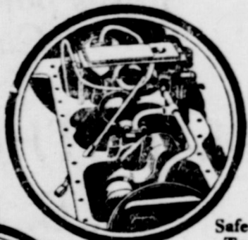
Safety Tube To Insure Continuous Oil Flow