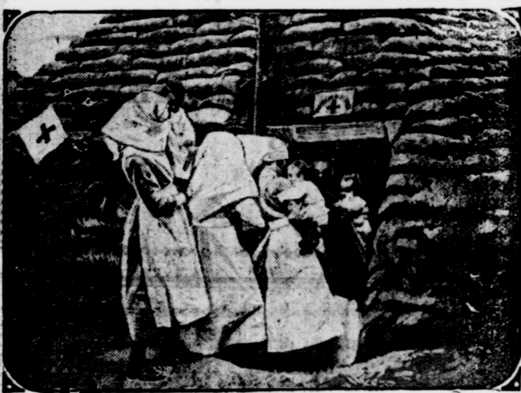
Hunger, disease and exposure were not all that Belgian children were subjected to, for enemy shells constantly dropped into what little of their country the invader did not hold. In this picture Red Cross nurses are seen taking some of the fifty babies from the American Red Cross nursery at La Panne into a bomb-proof structure as the Germans opened fire from the sea.