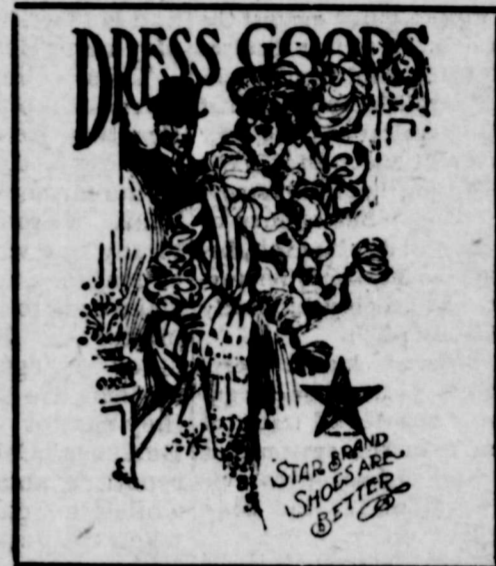
Dress Goods 10 Per Cent off

You will find our winter stock of Staple Dry Goods to be the best values for themoney, our Fine Dry Goods to be the best Weaves and Patterns. Broadcloth Mohairs, French Serges and Panamas. These come from 36 to 52 inches wide; colors: Blue, Brown and Black. Black Mohairs and Serges will be good for the season. They come in widths of 36 inches and the price per yard is.....50c Thread 5c a spool or a dozen for.....60c