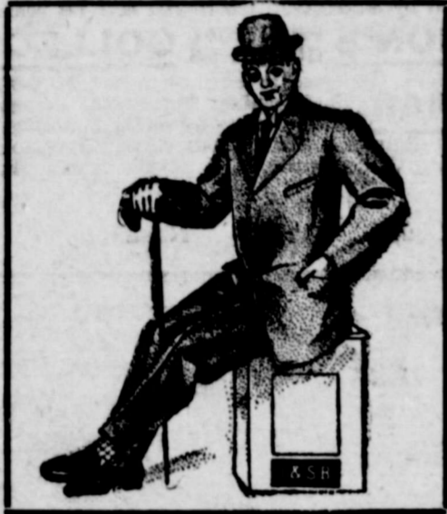
Men's Clothing 10 Per Cent off

In order to make you more interested in buying NOW your MEN'S CLOTHING, LADIES' WRAPS and FINE DRESS GOODS, we are going to give TEN PER CENT OFF the regular marked price until October 19th. This is for MENS SUITS and LADIES' WRAPS from $5. up; Dress Goods from 50c to $1.50 per yard. This means a $5. dress pattern for $4.50. A $10.00 Rain Coat or Jacket for $9.00. A $20.00 suit of clothes for $18.00. These prices are for cash only. In the entire lot you will find something worthy of your attention and money.