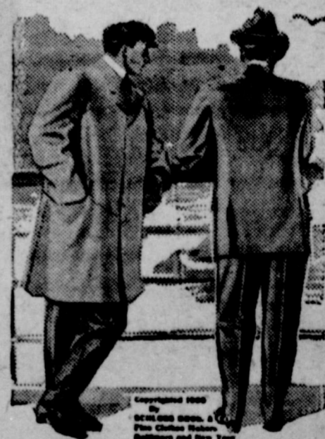
By SCHLOSS BROS. & CO. Fine Clothes Makers Baltimore and New York

LET US DRESS YOU UP IN THE LATEST STYLE.