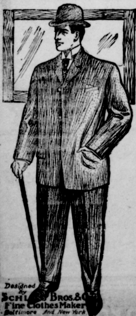
Designed by SCHLOSS BROS. & CO. Fine Clothes Makers Baltimore and New York

Such as rugs, art squares, lace curtains, curtain poles, window shades, matting, counter panes, towels, table linen shelf and table oil cloth. We have what you want, when you want it and at the right price.