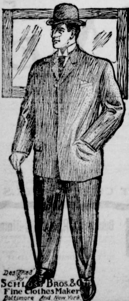
Designed by SCHLOSS BROS. & CO. Fine Clothes Makers Baltimore and New York

Such as rugs, art squares, lace curtains, curtain poles, window shades, matting, counter panes, towels, table linen shelf and table oil cloth. We have what you want, when you want it and at the right price.