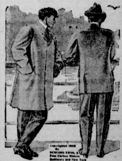
Copyright 1906 by SCHLOSS BROS. & CO. Fine Clothes Makers Baltimore and New York

LET US DRESS YOU UP IN THE LATEST STYLE.