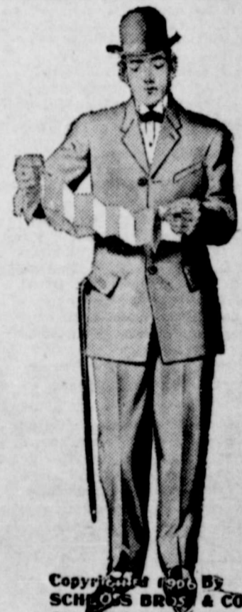
Copyright 1906 by SCHLOSS BROS. & CO. Fine Clothes Makers Baltimore and New York