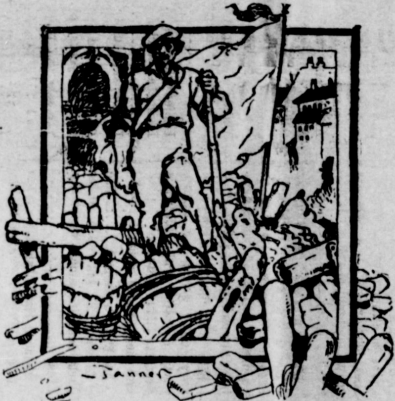
Find Another Communist.