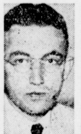
Arthur J. Altmeyer

JOHN G. WINANT, who as chairman of the social security board had a lot of trouble with certain senators over patronage and whose reappointment to membership on the board had not been confirmed by the senate, sent his resignation to the President. Mr. Roosevelt said Mr. Winant was retiring to attend to pressing private business and would be back in the federal service before very long. The former governor of New Hampshire has been considered a logical candidate for the post of secretary of social welfare if that department is created by congress.