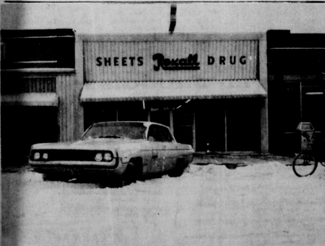
SNOW & ICY conditions in Spearman early this week made it very difficult for vehicles to maneuver on main street. In trying to back away from the curb, the driver of this vehicle found her car sliding round in a complete circle and headed in the wrong direction. City workmen sanded all streets early Tuesday.