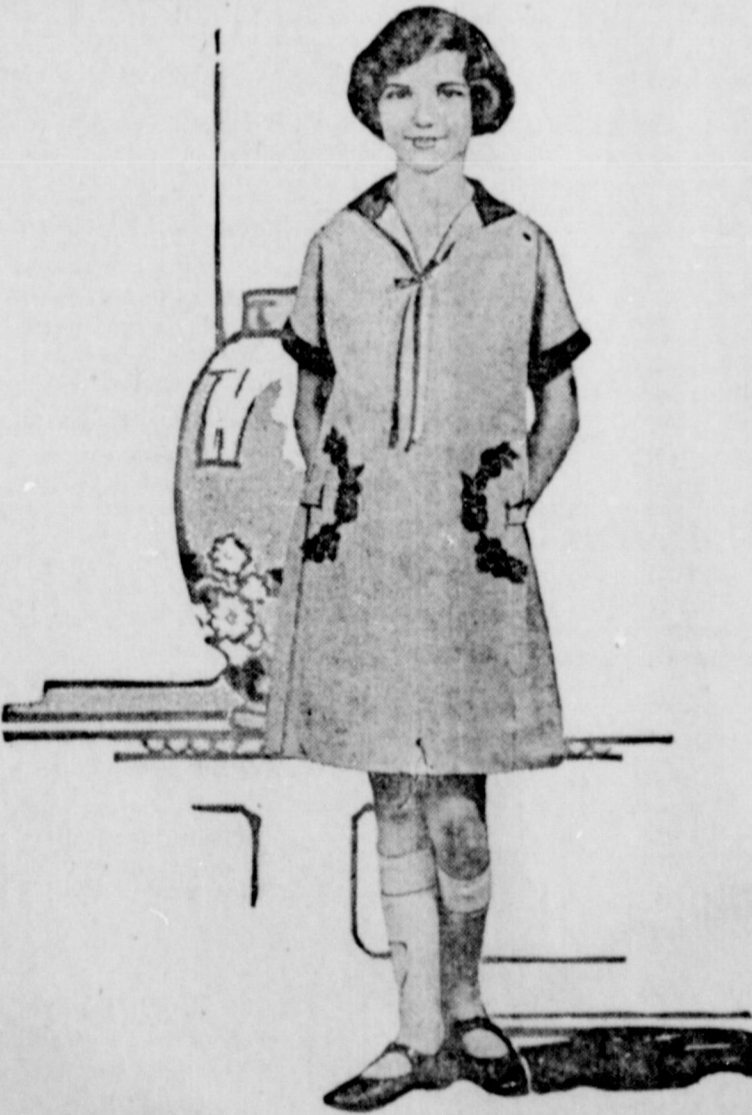
Pretty Dress for a Little Girl.

Double bands of fur impart a handsome touch to the coat here pictured.