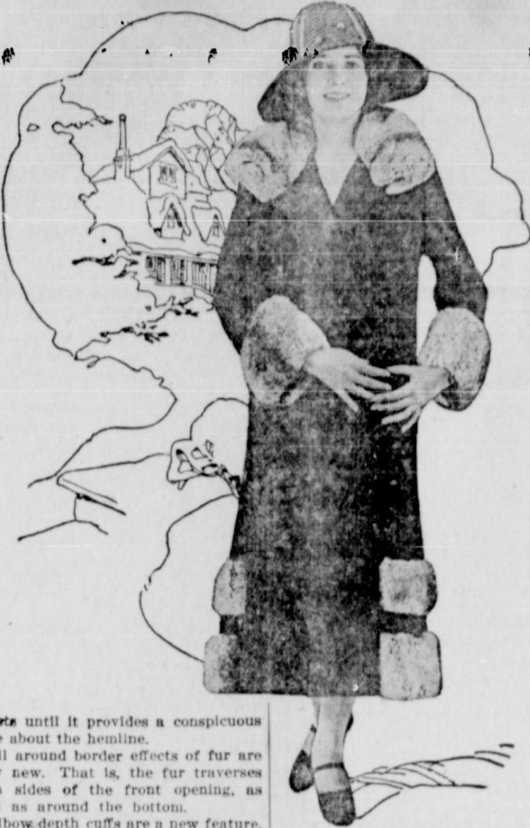
Fur Adds Handsome Touch to This Coat.

Balbriggan is its own best "reason why" it is so much in demand throughout the world of fashion. It abounds in likable qualities. Not only is it practical from the standpoint of price