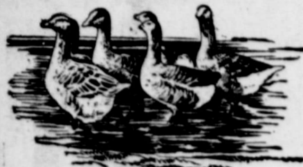
Well-Bred Toulouse Geese.

Before placing the bird in the barrel, tie a stout string to its feet, leaving one end hanging outside by which