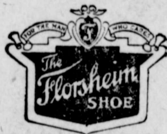
Agency The Florsheim Shoe for the Man Who Cares

But we want more of you men to profit by our knowledge of values and shoe fitting. It means a lot to you to be sure of getting satisfactory shoes.