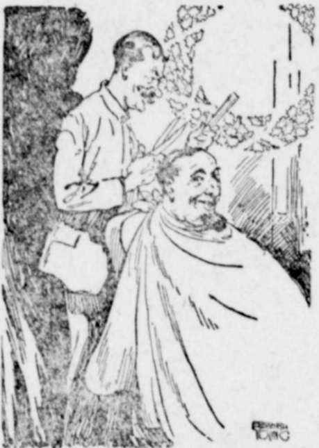
"I Decided on a Haircut for My Christmas Gift to Myself."

"Naturally, the thought first came to me what to give myself for Christmas. I always hand myself some slight token of my esteem at the happy yuletide. It compensates for what other folks hand me. A little gift doesn't