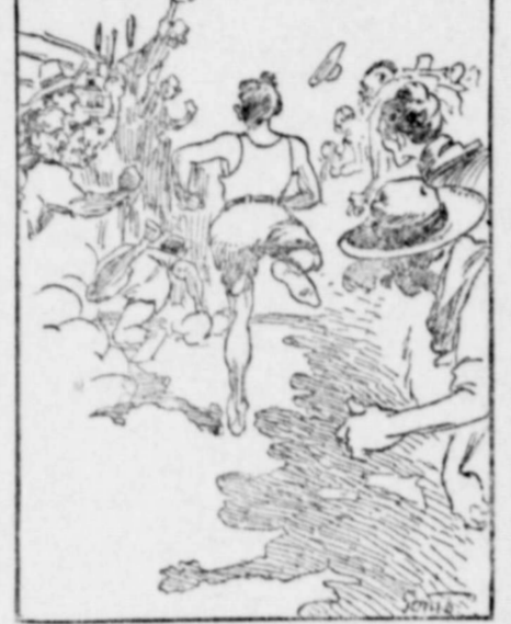
Skinner Had Fallen!

That evening J. Wallingford Speed and Helen Blake sat together in the