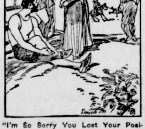
"I'm So Sorry You Lost Your Position, Mr. Skinner."

"Why, so it is!" Then as a fresh song burst forth from the very heart of the machine, he murmured affectionately: "By Jove! there goes 'The