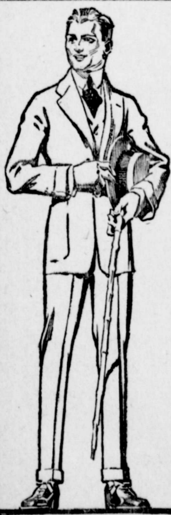
Copyright Hart Schaffner & Marx