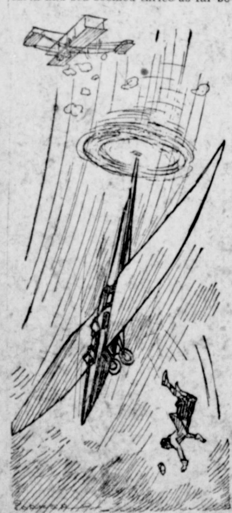
It Turned and Dived Headlong.

But the aviator only shook his head: and they continued to ascend rapidly; already the web of gold that cloaked feet higher than the Valkyr, which