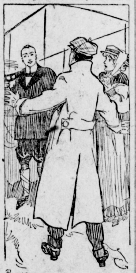
"Wertheimer!" He Exclaimed.

The Parrott had come to rest in what seemed to be a wide, shallow, saucerlike depression, whose irregular bounds were cloaked in fog. In this space no living thing stirred save those three; and as far as he could determine, the waste was crossed by not so much as a sheep track. In a word, they were lost. There might be a road running past the saucer ten yards from its brim in any quarter. There might not. Possibly there was a