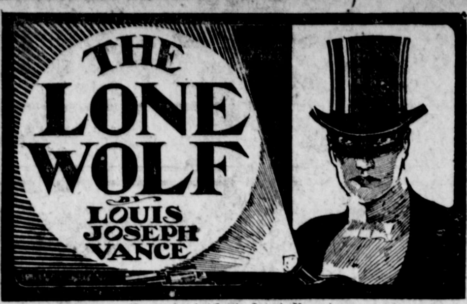
(Copyright, by Louis Joseph Vance.)