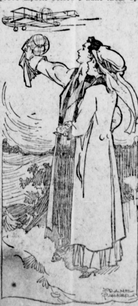
Listening to the Drone That Presently Dwindled to a Mere Thread of Sound.

"Forgive me," Lanyard interposed hastily; "but I don't care to know my family name. If I have no parents living, I've no kin who would welcome my return. And if I had-I prefer to prove myself before I hunt them up.