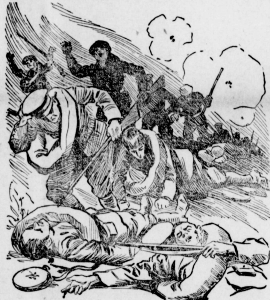
Now It Is Death by Machinery.

How the experts have, day in, day out, been inventing and constructing new marvels of mechanism. The mechanical side of war has been raised to a high standard of genius and a fine art. Two hundred and forty bullets and more to the minute! What a marvel of mechanism one of those machine-guns is. You set it buzzing, and it spurts out bullets thicker than rain can fall. And the automaton licks its lips hungrily and sweeps from right to left. It is