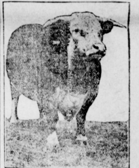
Excellent Beef Type.

The Shorthorn, Aberdeen-Angus, Hereford, Red Polled and Devon breeds of cattle all do well in the South. The Shorthorn does well on all lands where the pastures are good and feed is plentiful. The cows usually prove to be very good milkers, giving milk enough for the calf and to supply