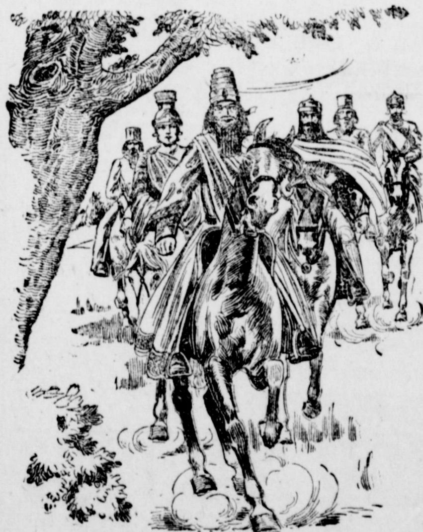
DARIUS MADE KING OF PERSIA.

THE neigh of a horse made Darius King of Persia, the six contending powers for the throne agreeing among themselves that the one whose horse should neigh first should possess the kingdom. This ancient method of settling disputes among politicians could be revived with profit in Texas today. If our partisan factions and petty politicians could only settle their disputes by the neigh of a horse, the bark of a dog or the bray of a donkey, it would be a great blessing for Texas and would give our citizens a better opportunity to pursue the vocations of industry free from political strife.