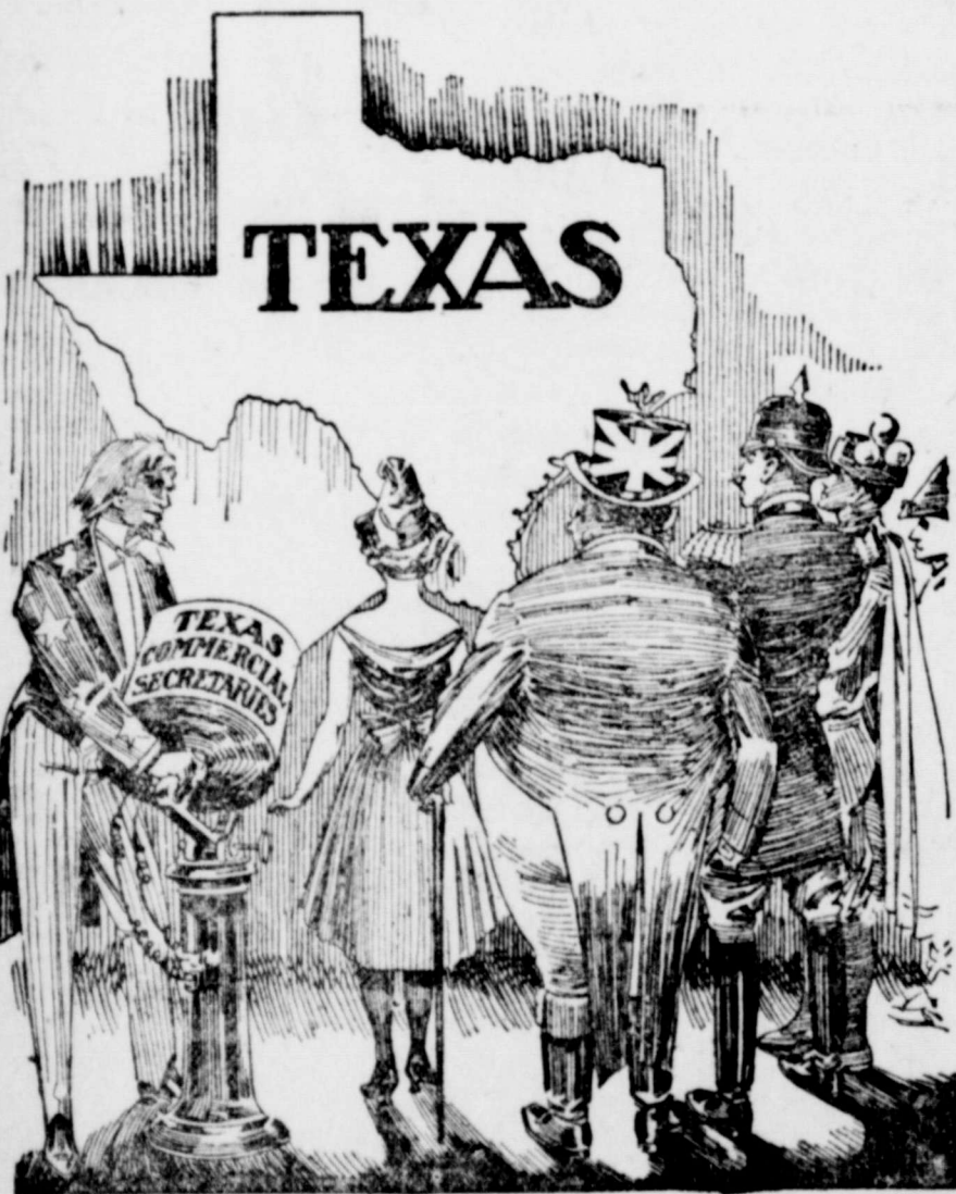
UNCLE SAM TALKING TEXAS

Prosperity always comes to countries that advertise. The Commercial Clubs of Texas are getting out literature that is shaking the continent and charging the atmosphere with progress, and the Commercial Secretaries are throwing the resources of Texas like a sunbeam across the pathway of civilization.