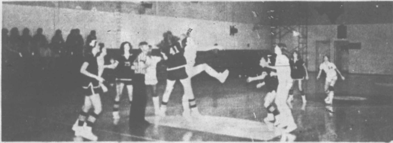
ACTION SCENE during Springlake-Earth tournament when the Hornets lost to Lazbuddie and won over Amherst and Springlake-Earth.

Sudan, Lamb County, Texas, Thursday, December 14, 1978 4 Pages Number 43 Volume 53