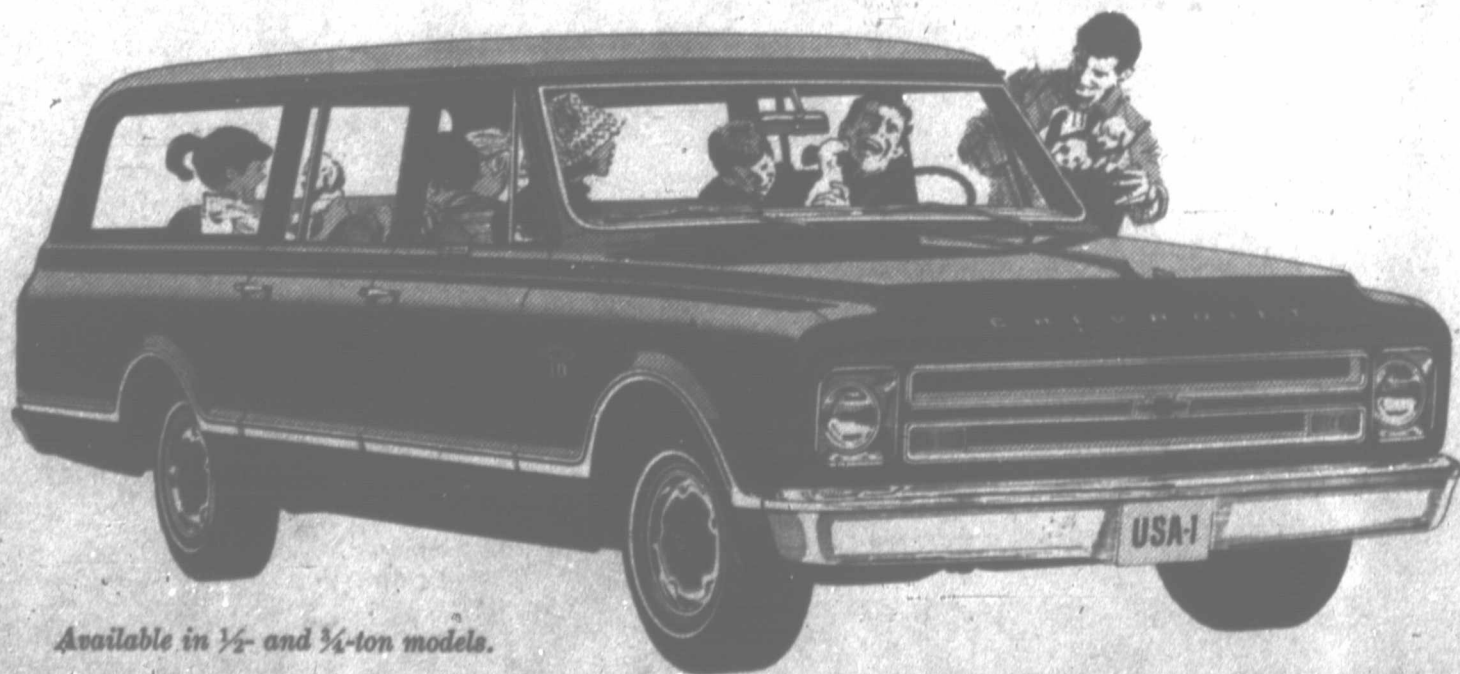
Available in 1/2- and 3/4-ton models.

The look, the ride of a station wagon, plus a tough truck chassis!