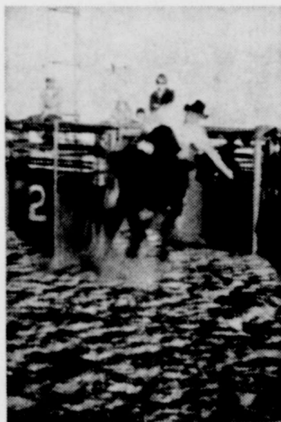
BILL JAYNES — Riding Black "S"