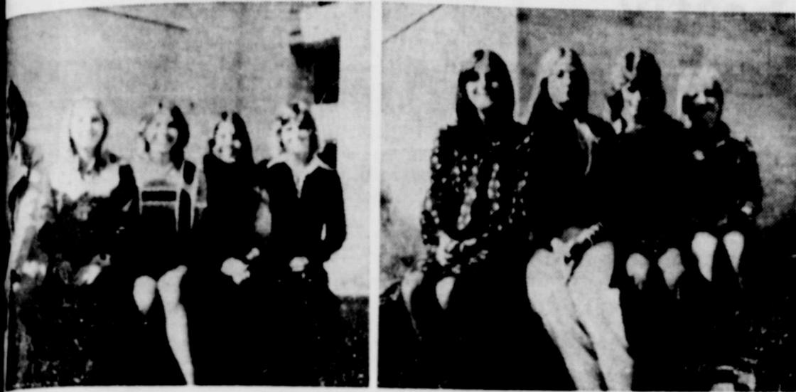
Above are the nine Midkiff girls who competed in next Monday's Beauty Pageant. A group from McCamey is