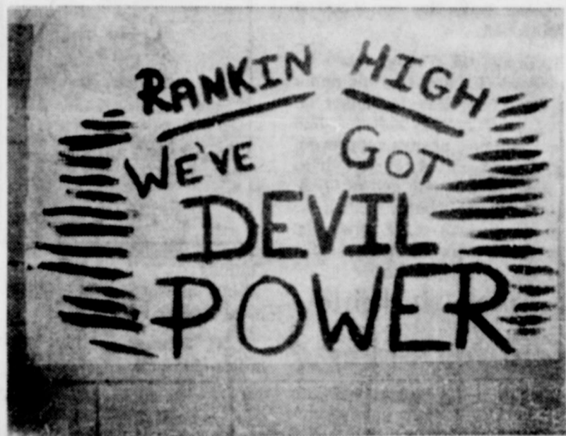
Sign of the Times—in RHS hallway