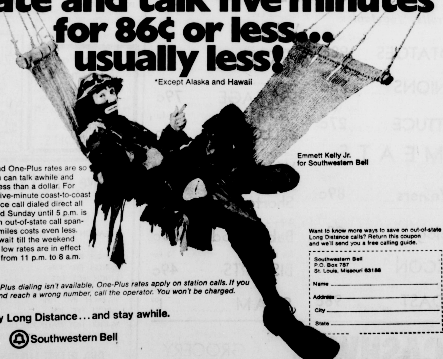
Emmett Kelly Jr. for Southwestern Bell

Our weekend One-Plus rates are so low that you can talk awhile and still spend less than a dollar. For instance, a five-minute coast-to-coast Long Distance call dialed direct all Saturday and Sunday until 5 p.m. is only 86¢. An out-of-state call span- ning fewer miles costs even less. If you can't wait till the weekend these same low rates are in effect every night from 11 p.m. to 8 a.m.