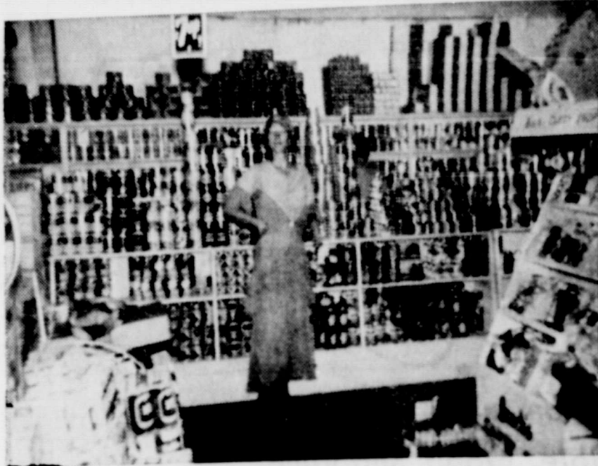
FROM YESTERYEAR — Think you're pretty good at recognizing someone—try this. The picture isn't too clear but if you know your Rankinites, you should get this one. Don't let the dress fool you. It's not related to the date. See back page.

AT THE NEWS OFFICE: Invitations, colored poster board, magic markers—fine and wide points — dictionaries, pencils and pencil sharpeners, Scotch tape, file boxes, index cards, lettering stencils, file folders,