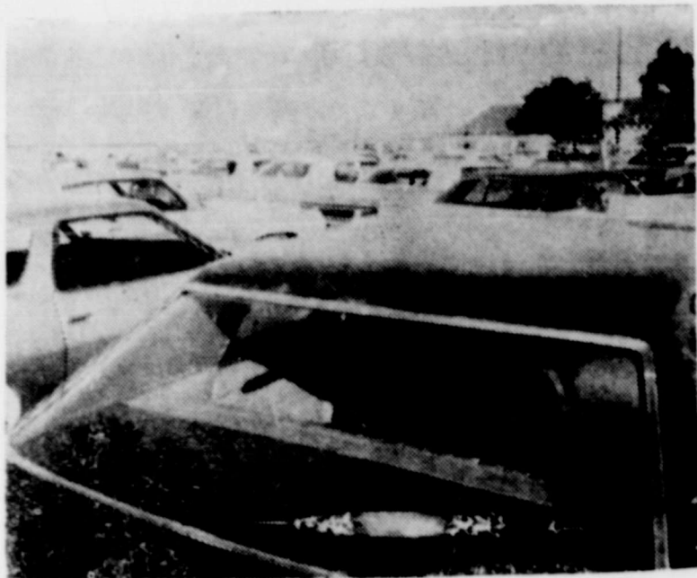
Even in the parking lot it was standing room only last Sunday evening as Rankin hosted the first rounds of play in the Upton County Golf Championship. Over 100 persons attended a supper following the match.