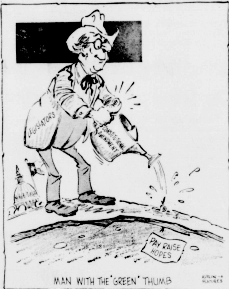
MAN WITH THE 'GREEN' THUMB